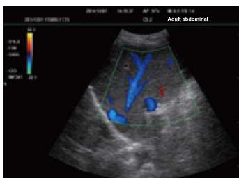
Morphology of Liver Tissue (Color Doppler Image)